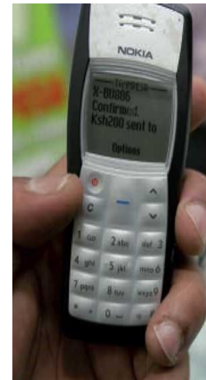
USSD - *483*93#